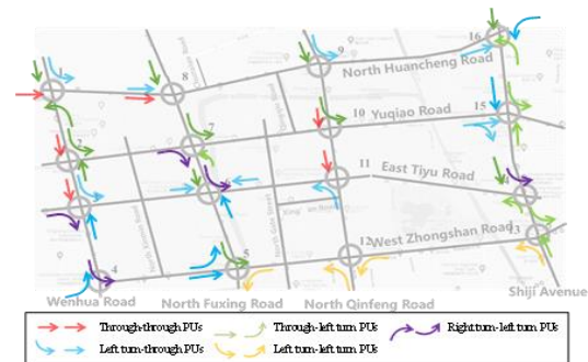
Figure 3 CPU set obtained by the proposed model