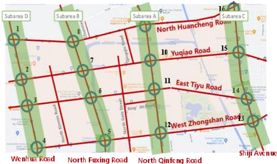
Figure 2 Subarea division scheme obtained by Synchro

Based on the criticality evaluation mechanism, the critical PU set of the optimal timing scheme with a common cycle length of 66s is shown in Figure 3. It can be seen that the proportion of PUs whose upstream and downstream movements are both through movements is only 10.7%, while the proportion of PUs including turning flows dominated in the critical PU set. From this perspective, the simulation scenario is not applicable to the traditional arterial coordination control model targeting at the through paths or the arterial mainlines, which explains the poor performance of the subarea-based Synchro and MULTIBAND schemes, and also implies that the AMPIC self-optimization of the proposed model can better adapt to scenarios where traffic demands of turning flows or several conflicting flows within the intersections are considerable.